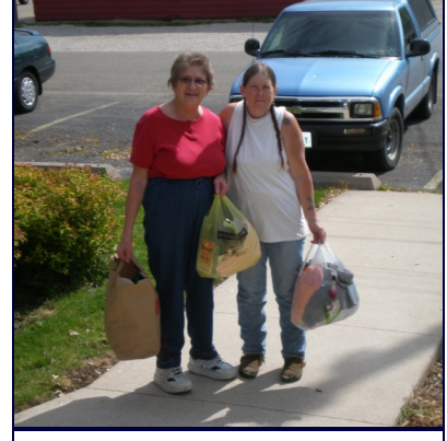
Berwick Baptist Church's Women's Fellowship kindly donated clothing, household items, and personal hygiene supplies.