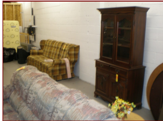
A larger sales floor has allowed us to expand our furniture selection.