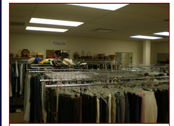
Women's pants have moved to the middle of the store, and we now have an entire room dedicated to displaying holiday items year-round!