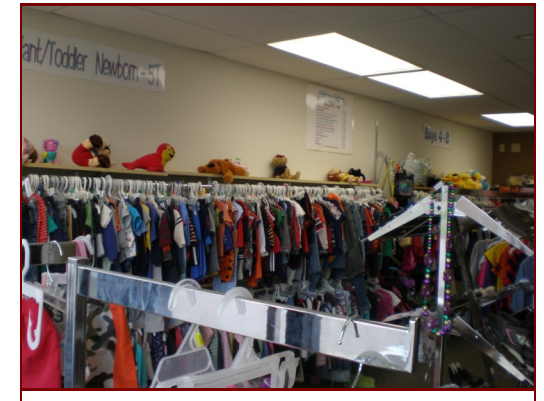
Moving the majority of our toy selection to the back of the store has allowed us to display even more infant and children's clothing.