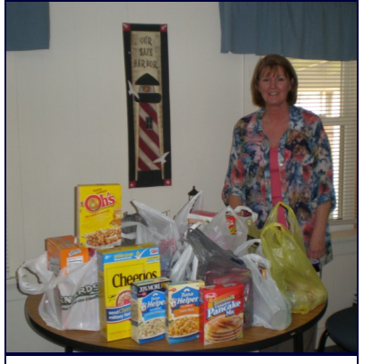
West Central Illinois Association of Realtors donated cash and food items to help stock our pantry.