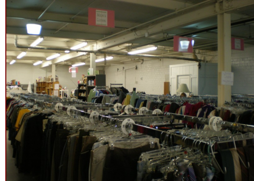
Men's clothes have moved to the back of the store, along with out-of-season clothing, "vintage" items, toys, books, and more.