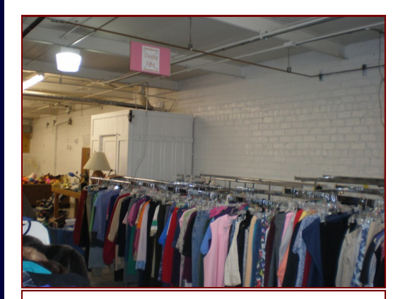
We have introduced our "Thrifty Fifty" discount section, where all items are only 50 cents each!