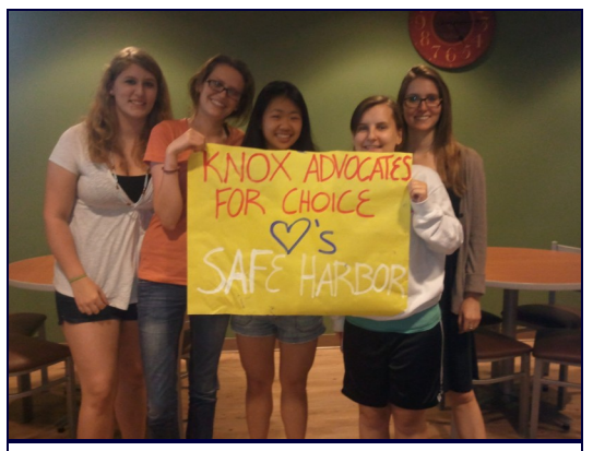
Knox College Advocates for Choice raised funds for Safe Harbor in the amount of $68.56.