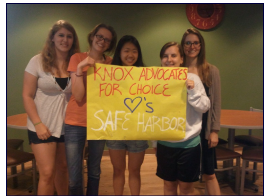
Knox College Advocates for Choice raised funds for Safe Harbor in the amount of $68.56.