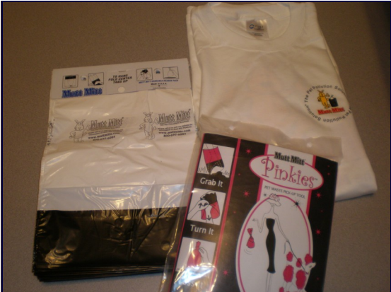
M u t t M i t t s