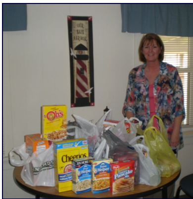
West Central Illinois Association of Realtors donated cash and food items to help stock our pantry.