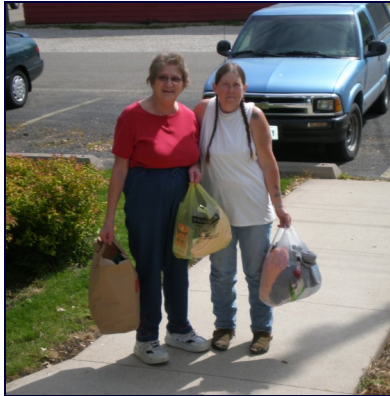
Berwick Baptist Church's Women's Fellowship kindly donated clothing, household items, and personal hygiene supplies.