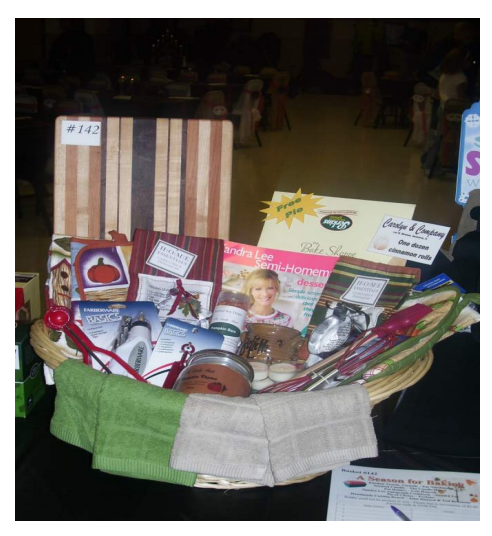
Above Left: The generously donated talents of the band, No Reason, got the party started and kept it going throughout the night. Above Right: An example of one the themed baskets that were filled through generous donations from local and national businesses, organizations and indviduals.

Everyone at Safe Harbor is excited about this year's Fall Fundraiser. As always, there will be themed baskets for the silent auction. Donations have been arriving and the range of baskets will be awesome and just in time to fill your Christmas list needs! The band, No Reason, and the pizzeria, The Cellar, have generously announced that they will again donate their talents for music and food for the event. This year's raffle item will be an iPad 2. The price of the ticket includes admission, food and music.