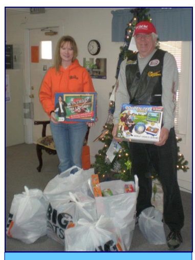
Central Illinois A.B.A.T.E.