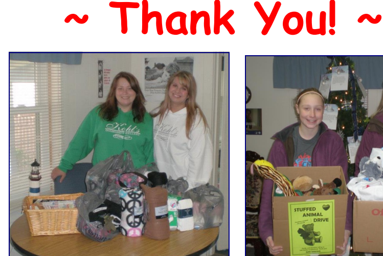
Kohl's Diamond Gallery