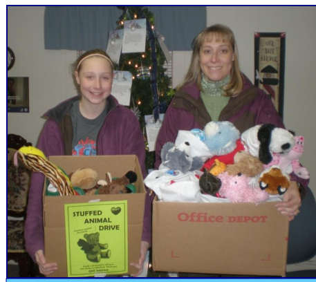
Galesburg High School Interact Club