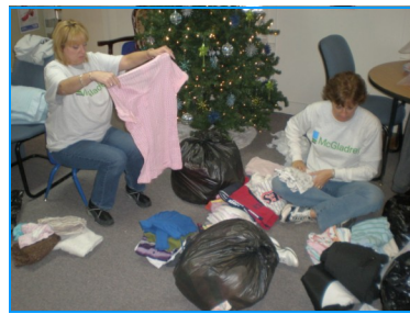
Sorting Donations for the Purple Hanger