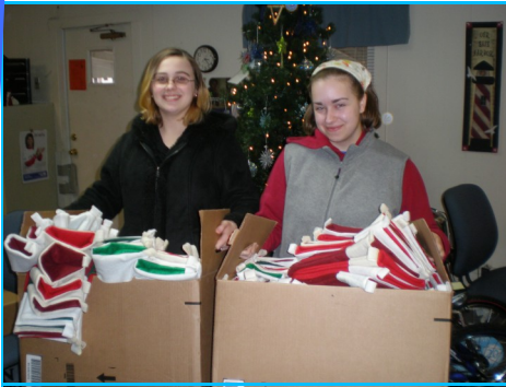
Members of the Galesburg High School Interact Club made 200 stockings for children served by Safe Harbor.

To all who helped make the holidays a little brighter this year: