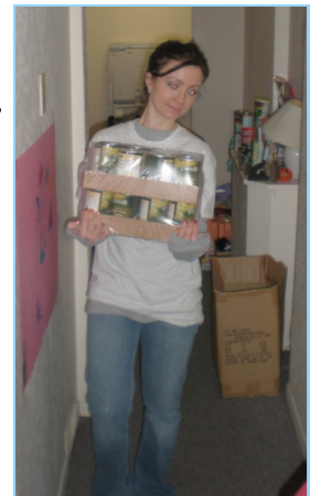
Restocking the Food Pantry