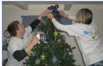
Preparing for Christmas